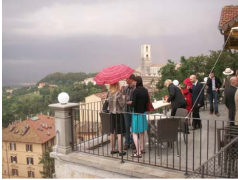
(Participants enjoying the beautiful summer view of Perugia)