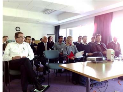
(Participants in the Brighton workshop)