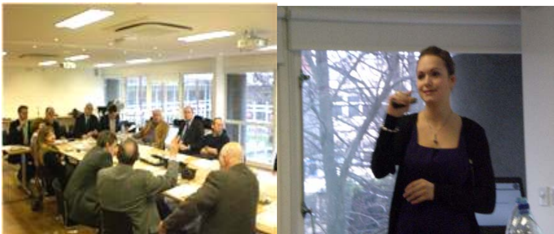
(Participants in the seminar)